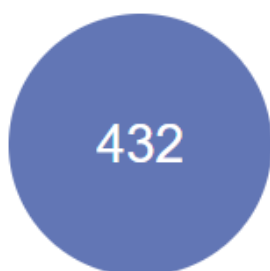
Ever 6 FSM